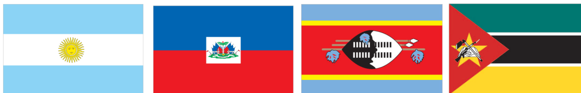
Figure 2. Flags of Argentina, Haiti, eSwatini, and Mozambique.

The inclusion of independence on flags was most prominent in the Portuguese empire, followed by those of Spain, France, and finally the United Kingdom. With every single Portuguese country celebrating its sovereignty on its flag, one can infer that the empire's colonial history is incredibly important to its former subjects. This may indicate that perhaps Portugal's reign was abnormally harsh or controlling, or that they held on to their overseas possessions for such a long time (most of their colonies did not break away until 1975) that their status of independence is completely unprecedented in the modern world and thus worthy of celebration more than countries with shorter periods of colonization. Spain's colonies also understandably reference their independence, considering that they had the most violent separations, with two thirds of their empire earning independence through conflict. A country forged in blood is more likely to commemorate its sovereignty to honor the sacrifices of its forebears and the magnitude of their triumph over a more powerful foe. Even Argentina, which itself has become a significant power since breaking away from Spain, still represents a key moment of their path to independence on their flag: the sun refers to an independence rally in the early 19 th century during which sunshine notably shown through the clouds (Figure 2).