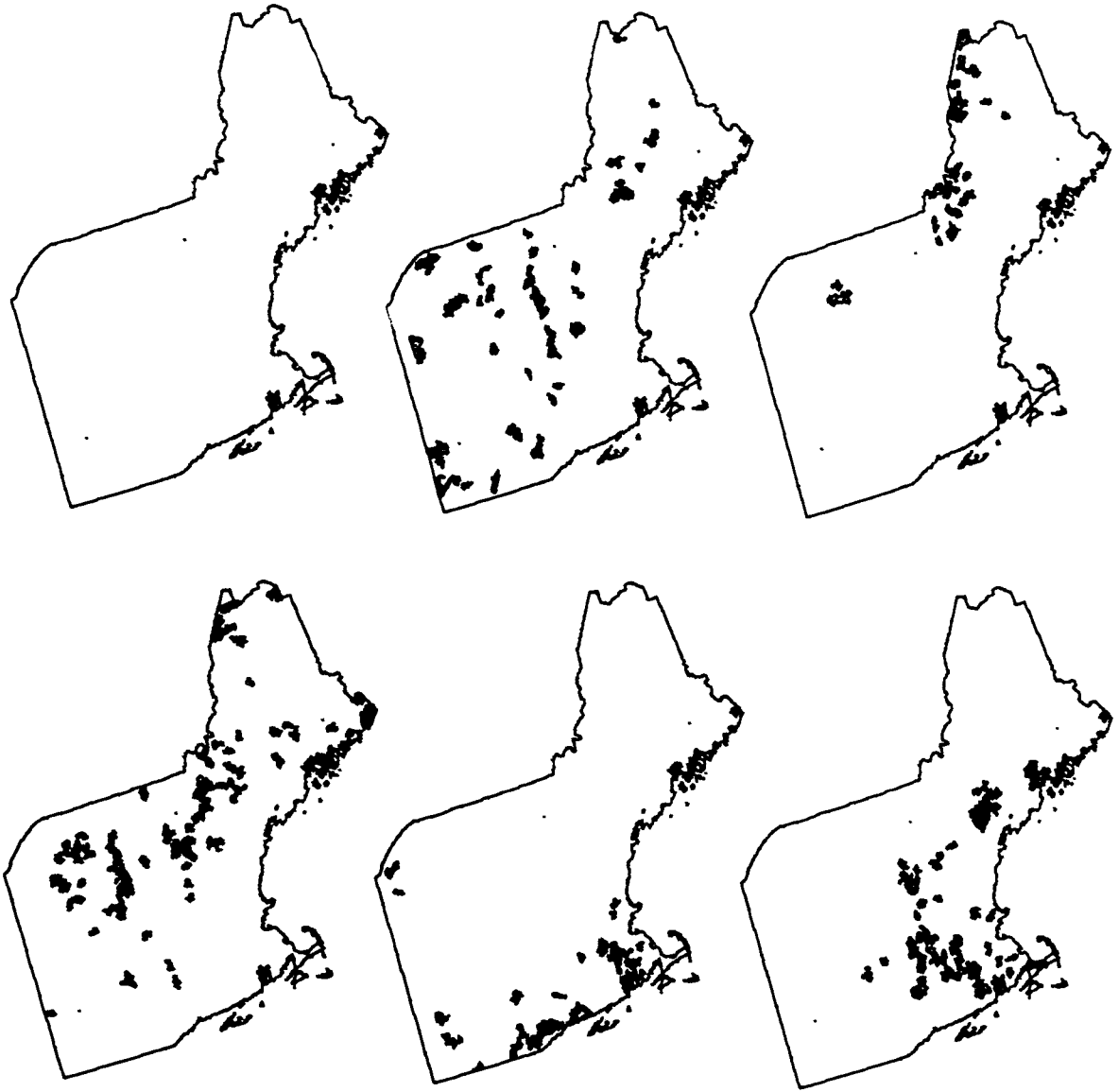
Figure 3. Medium size forest clumps (50 - 500 pixels) identified in clump-mean NPP and integrated NDVI analysis.