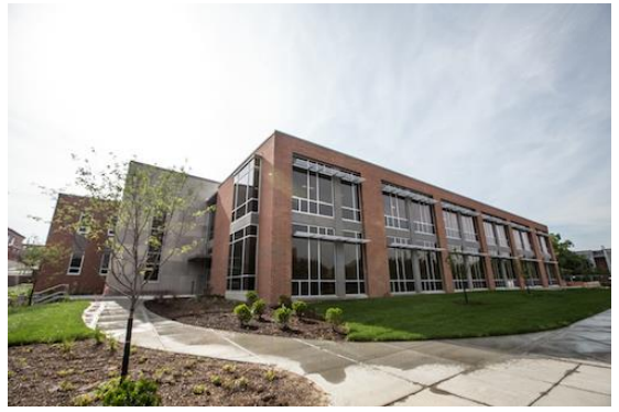
View of Bailey Hall from the east.

From the North or East. Take the New York State Thruway to Rochester Exit 46. Follow Route 390 South to Geneseo Exit 8. Turn right and follow Route 20A West approximately 5 miles. Turn right at the third traffic light onto Main Street (Route 39). Take the first left onto Park Street.