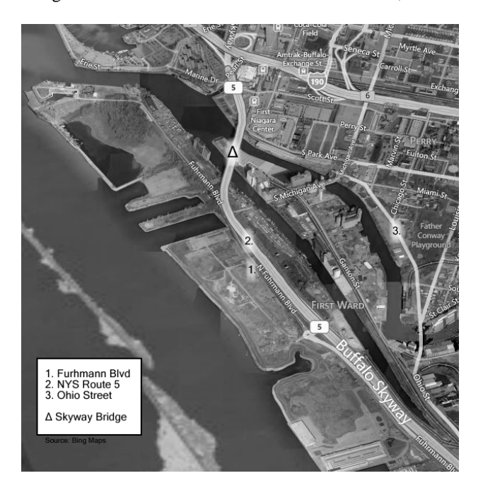
Figure 2. Buffalo Outer Harbor Parkway Project site.

The resulting "evolutionary mismatch" is especially apparent along the city's outer harbor, where commercial, industrial, and transportation land uses effectively separate the Lake Erie waterfront from the rest of the city (NYSDOT, 2006; City of Buffalo, 2007)(Figure 2). In the context of the Platt model, historical activities in Circle 2 (Figure 1) necessitated significant infrastructural investments such that, in a zero sum fashion, the city's