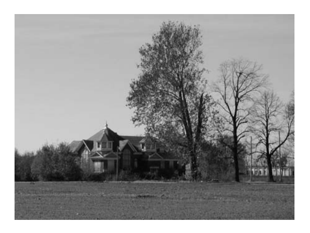
Figure 4. Boarded up houses in old townsite.

"Well, not gone, but the place where they happened is. All those old stores, the old houses, the place where various parts of your life happened. So that nostalgia part of the town is gone. But it's still Pattonsburg, we still have our community. Everybody still goes to the coffee shop — except now it's up at the filling station." Some in town are trying to preserve a sense of continuity with the old town. Historic Pattonsburg, Inc., a group of local history enthusiasts, took the long-abandoned train depot (from which the last train left in 1939), moved it to the new town, and is restoring it as a historical museum.