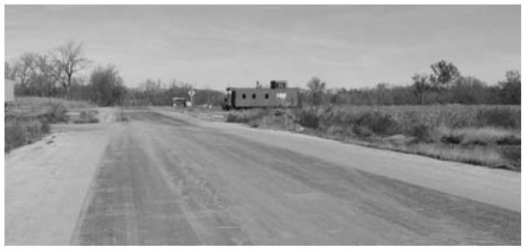
Figure 3. Scenes from old Pattonsburg a) church and b) old Main Street.